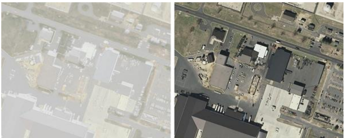
An image displayed with the alpha channel information (left) and without the alpha channel information (right)

Some imagery may have embedded alpha channel information, which can affect the colors of an imported image, making it look faded or grey. Now Surfer gives you the option to ignore the alpha channel for any imported image. Ignoring the alpha channel will import these graphics in rich, true and detailed color.